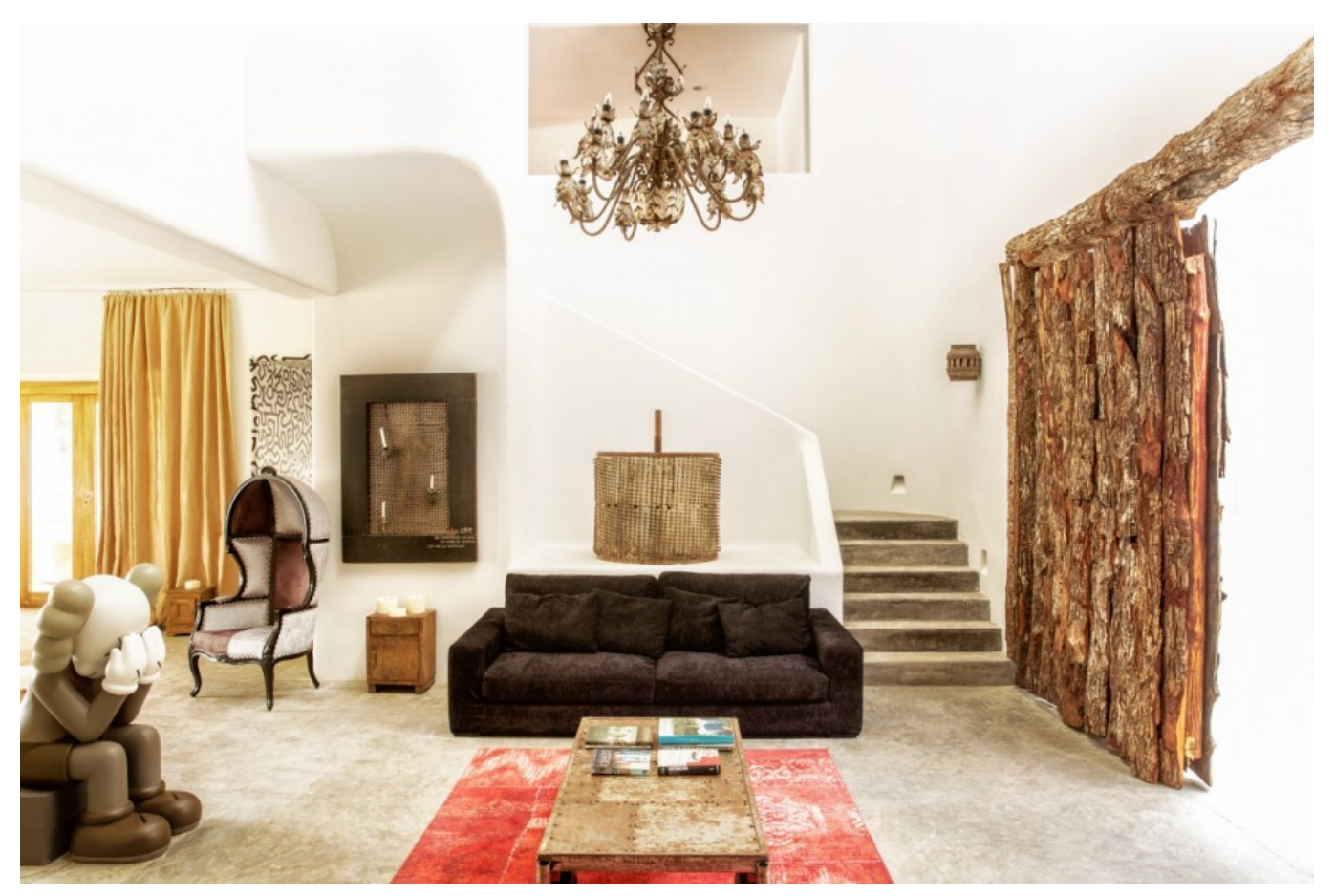
KAWS sculpture in the lobby of Casa Malca.