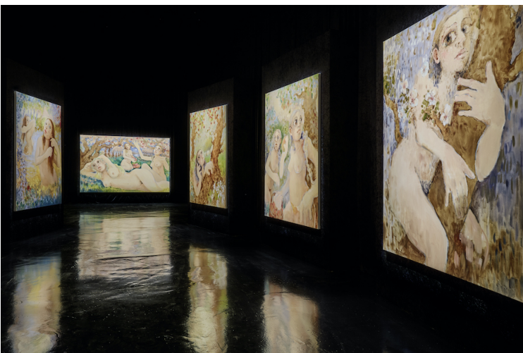
MaiBlanco LaNave Detail.jpg

Installation view of Mai Blanco's “Jardín Adentro” at Fundación La Nave Salinas